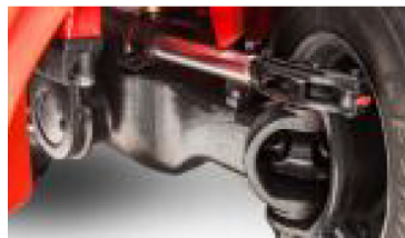
Tight Turn Radius