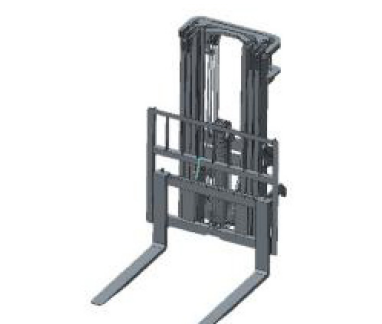
Clear View Mast